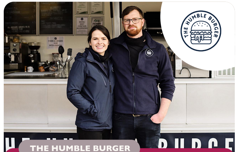
THE HUMBLE BURGER

The Humble Burger began as a food truck in Elgin and has become a local favourite, earning rave reviews and winning the 2024 Moray Chamber Most Promising Enterprise award.