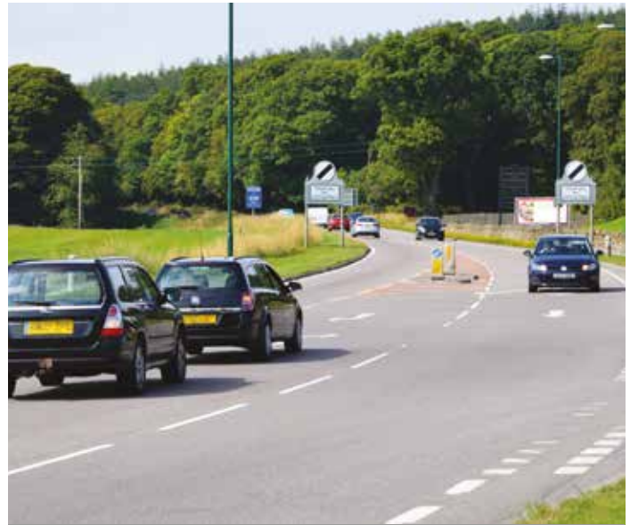
A96 Elgin West