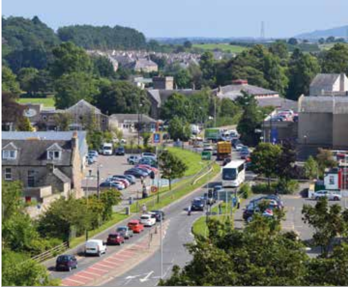
A96 at Elgin looking east

The options assessment process takes into account the scheme objectives and the Scottish Government's five appraisal criteria, namely; environment, safety, economy, integration and accessibility and social inclusion.